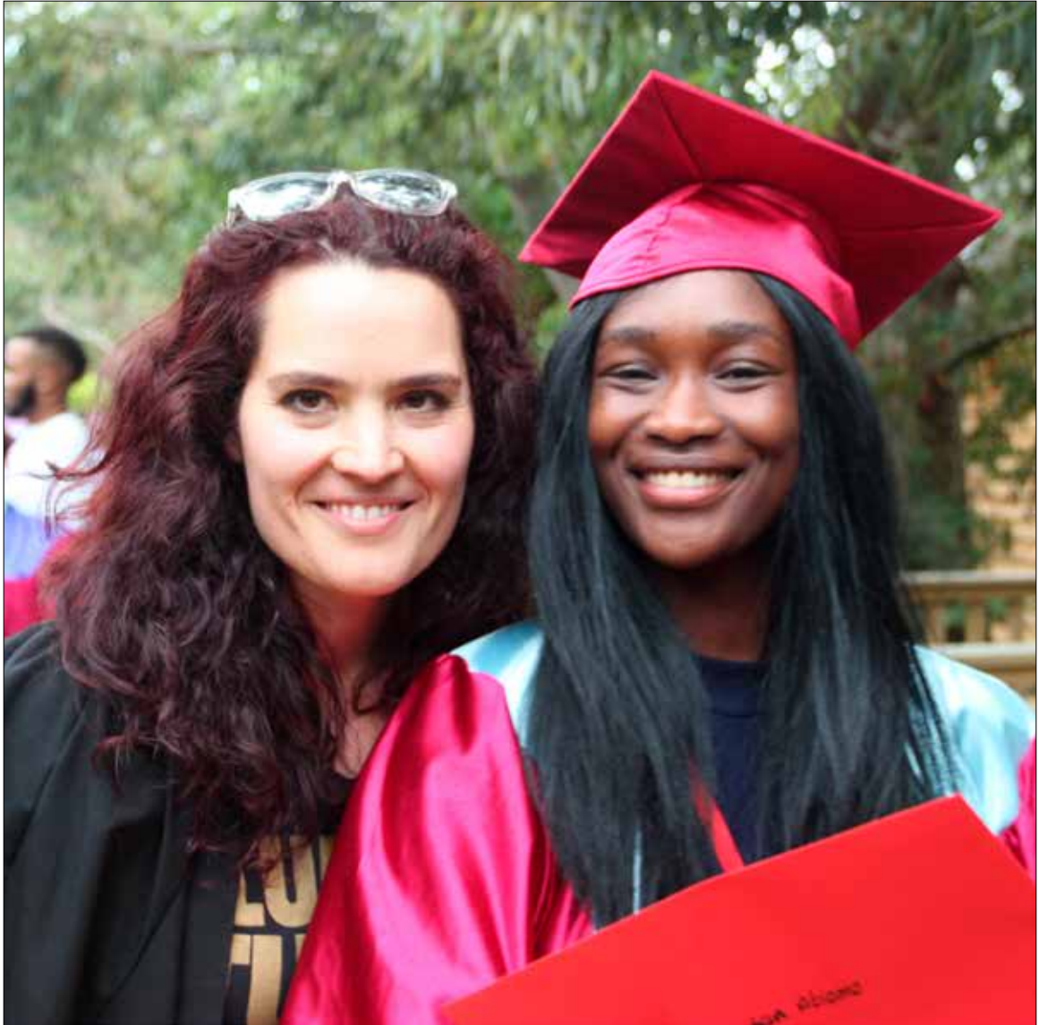
Buckwood: 100% university entrance rate