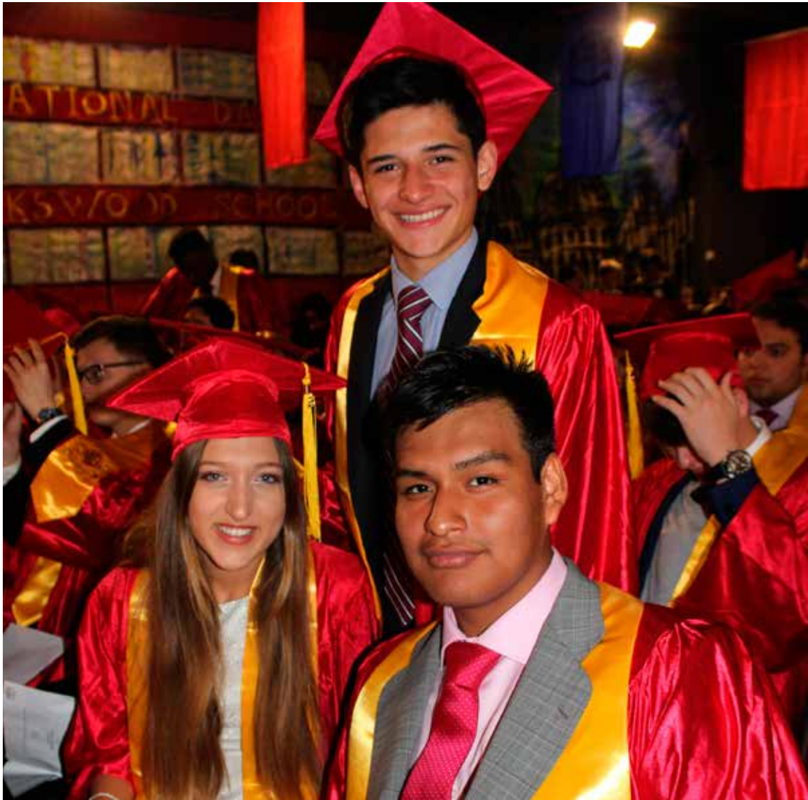
Buckswood: 100% university entrance rate