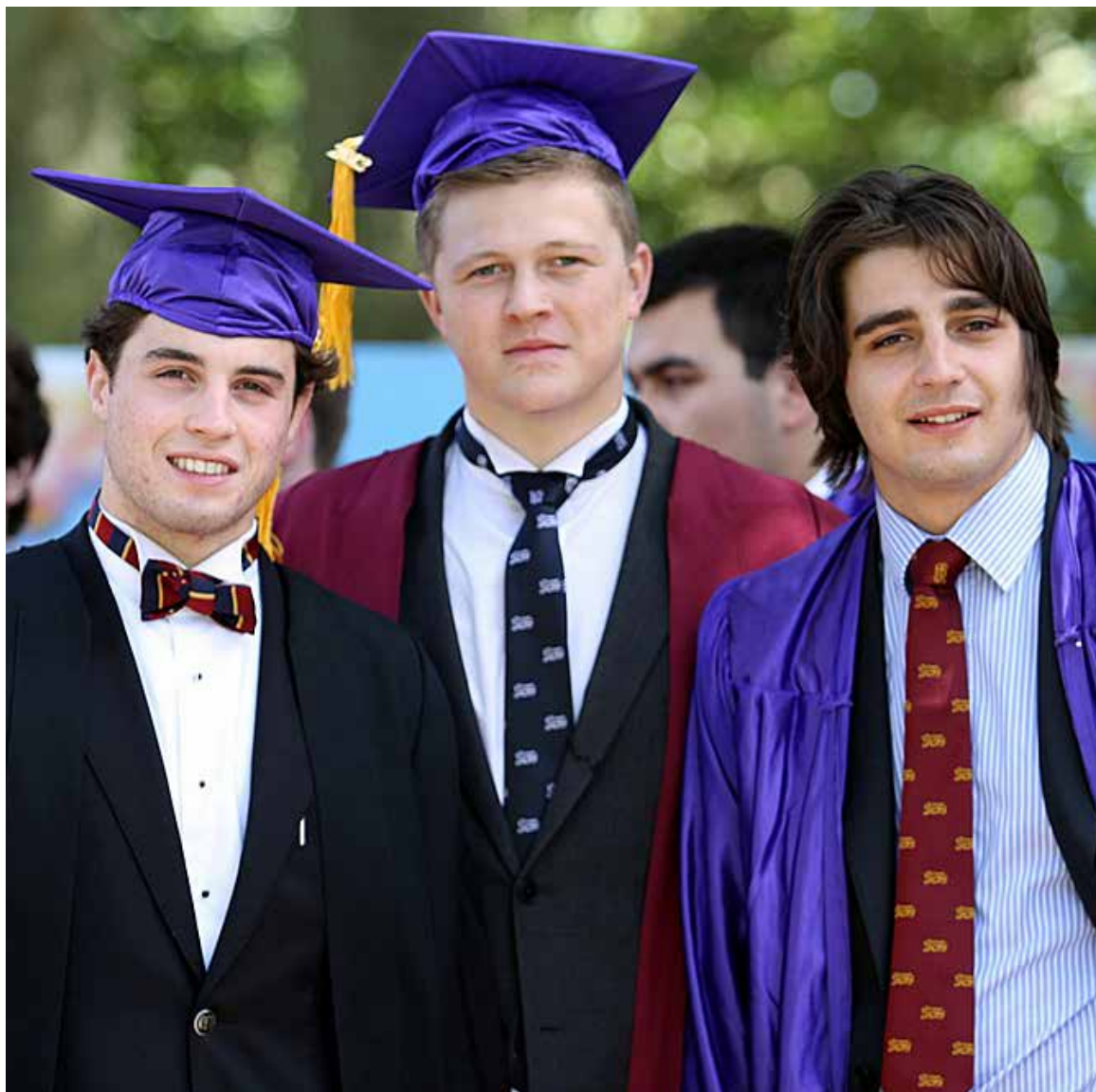
Buckswood alumni: friends for life