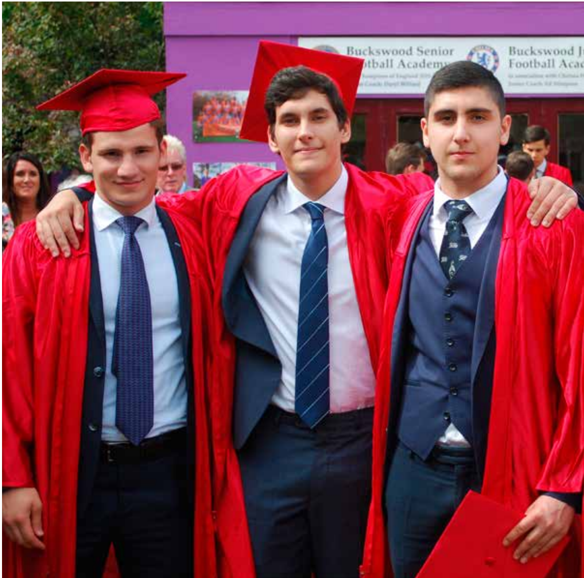
IB boys off to their first choice of university