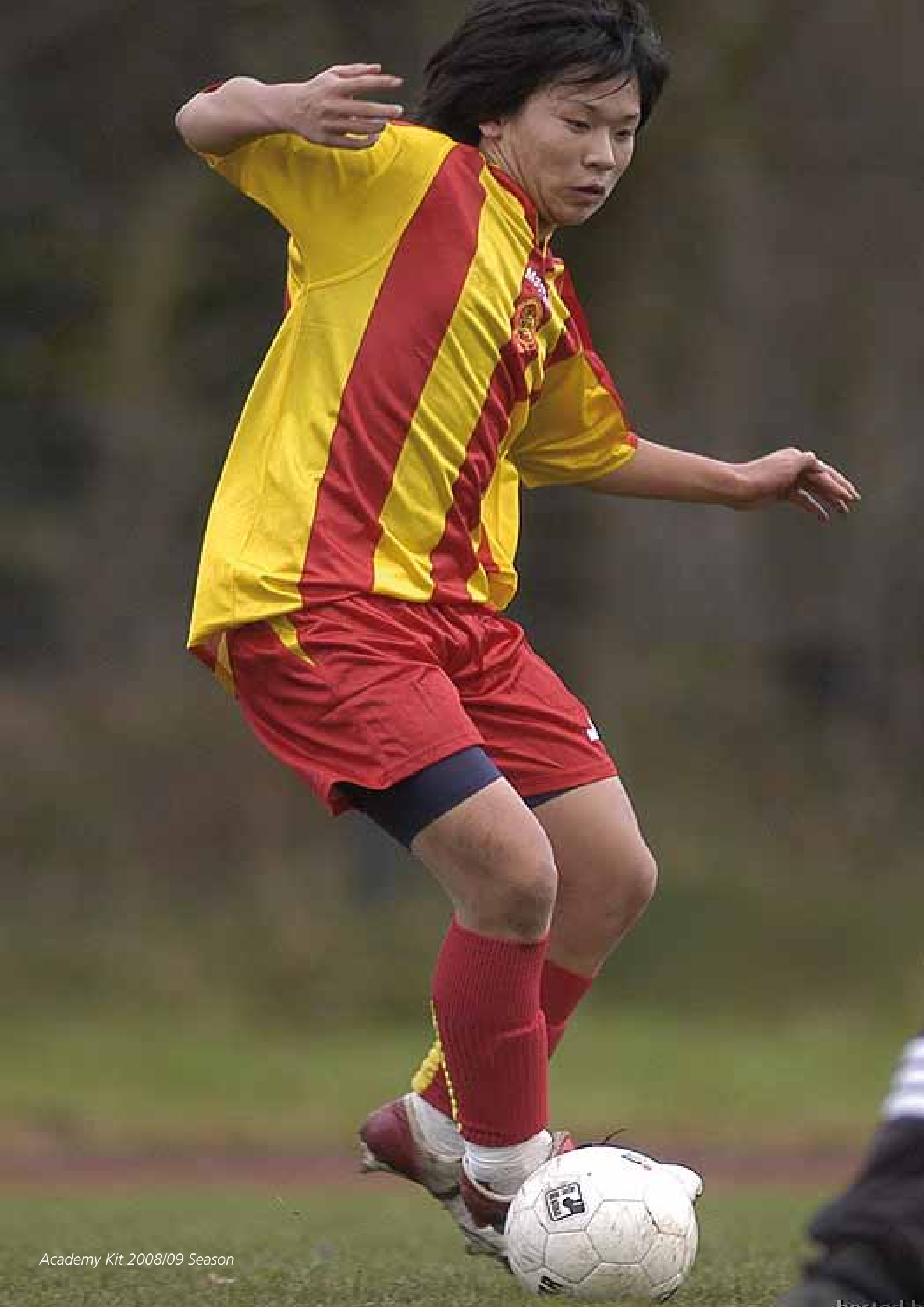
Academy Kit 2008/09 Season