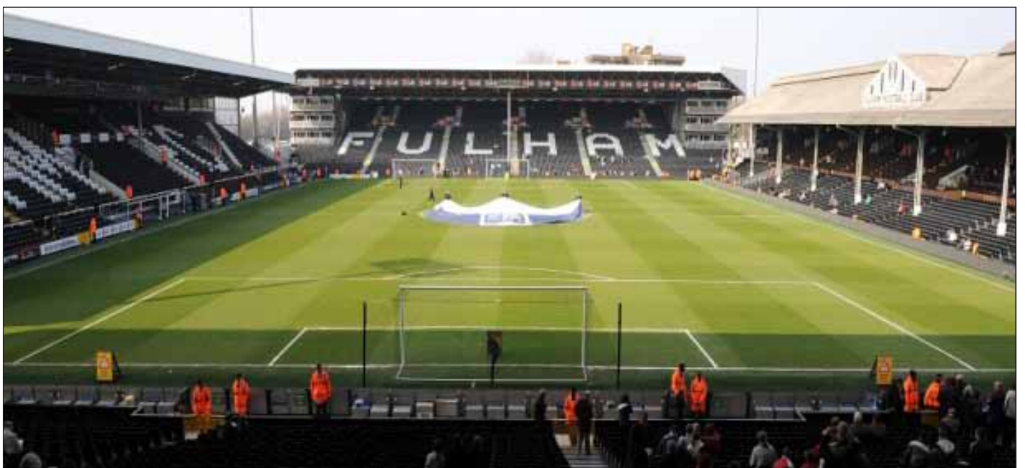
Fulham's football ground